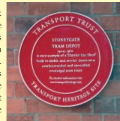
The Tram Depot was awarded a prestigious Transport Trust 'Red Wheel' heritage plaque in 2016.

A great deal of repair and cosmetic work has been undertaken and the premises are opened to the public on an occasional basis when the Trust is able to display a selection from its vehicle and archive collections. The interest and support of the public has been nothing short of exceptional. The next stage is to transform the Tram Depot into a permanent Transport Heritage Centre for the public to enjoy.