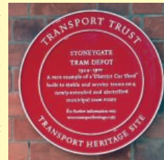
The Tram Depot was awarded a prestigious Transport Trust 'Red Wheel' heritage plaque in 2016.

A great deal of repair and cosmetic work has been undertaken and the premises are opened to the public on an occasional basis when the Trust is able to display a selection from its vehicle and archive collections. The interest and support of the public has been nothing short of exceptional. The next stage is to transform the Tram Depot into a permanent Transport Heritage Centre for the public to enjoy.